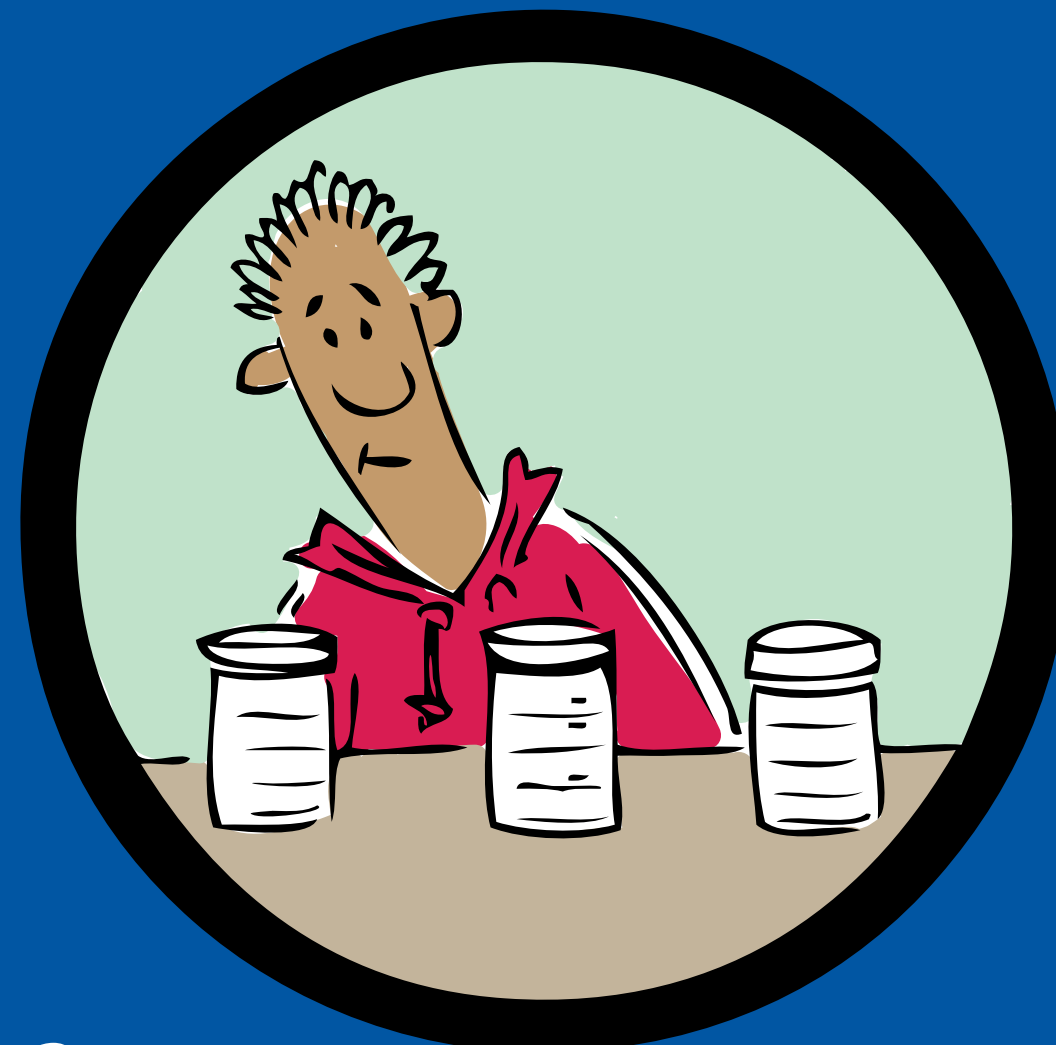
3. Select collection equipment.