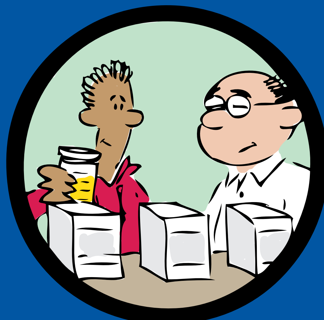
5. Choose a Sample Collection Kit.