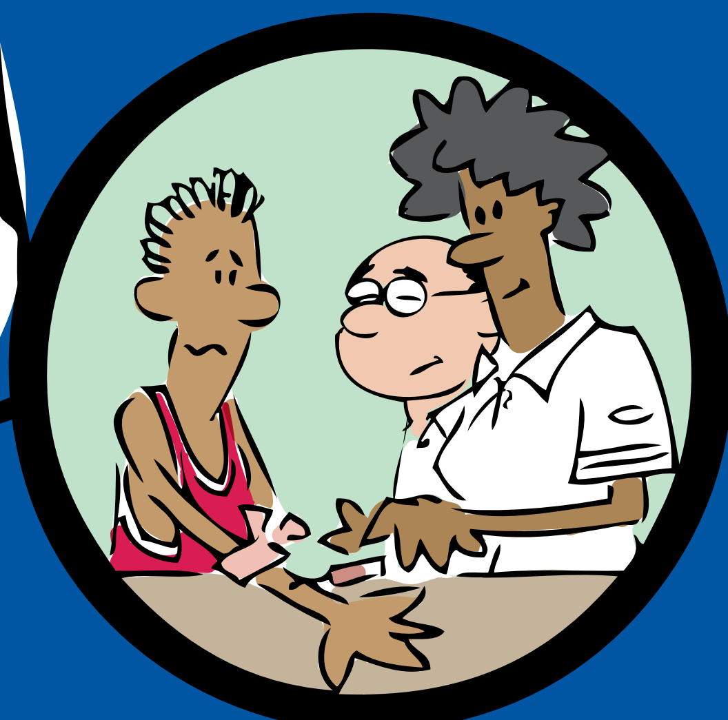
7. You may be required to give blood.