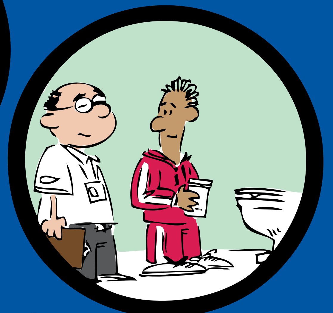
4. Provide urine sample.