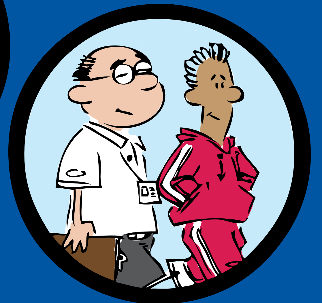
2. Report to the Doping Control Station.