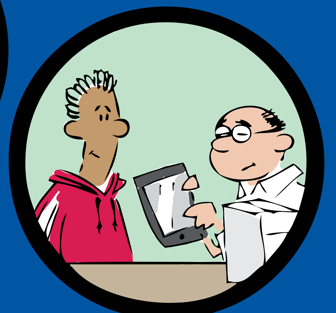
8. Declare medications taken.