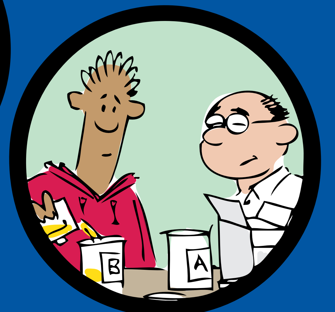
6. Split and seal the sample.